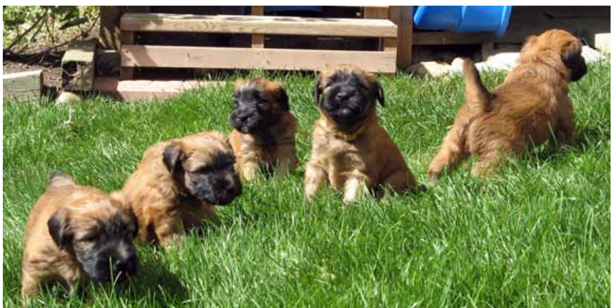
© 2012 All Rights Reserved, Soft-Coated Wheaten Terrier Association of Canada

Management of your puppy's environment and training needs begin before your puppy arrives home. Wheaten Terriers thrive with positive, non-punitive methods