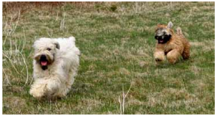
© 2012 All Rights Reserved, Soft-Coated Wheaten Terrier Association of Canada

You should expect to have your Wheaten Terrier's coat trimmed every six to twelve weeks. The shorter the coat the easier it is to keep mat free and the less time it will take to brush, bath and dry.