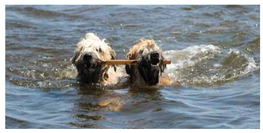
© 2012 All Rights Reserved, Soft-Coated Wheaten Terrier Association of Canada

Soft-Coated Wheaten Terriers are happy, quick-witted, lively and affectionate dogs that retain their puppy exuberance and active curiosity throughout their lifetime. They are steady, self-confident and exhibit less aggressiveness than is sometimes associated with other terriers. Training is of the utmost importance if you are to have a Wheaten Terrier that is obedient. They are highly intelligent, eager to please and easily trained if the appropriate methods are used. Harsh treatment may make them stubborn or timid. They respond much better to positive reinforcement than to hard discipline. They are good travellers, adaptable and enjoy life in the country or city. The Wheaten Terrier is a family dog, usually attaching themselves to a family, rather than an individual. They are at their best when they share family life to the fullest. They thrive on human companionship and attention. This is not a backyard type of dog. Wheaten Terriers should be an active part of your family.